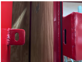
locking security hasps