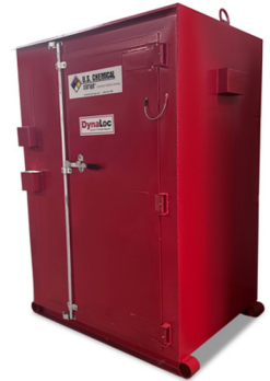
Type 4 Outdoor