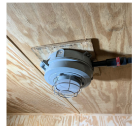
explosion proof electrical options