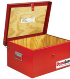
Type 3 Daybox