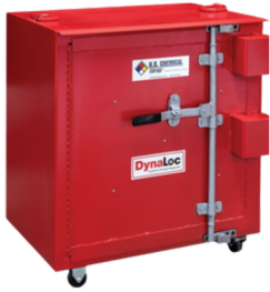
Type 2 Indoor