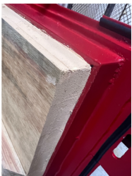
solid wood construction