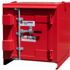
Type 2 Outdoor