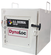
IME Day Boxes